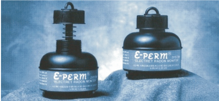
Model : E-PERM®